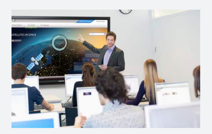
Figure 2. New lines of communication in the classroom

Gone are the days of educators needing to factor in the logistics of a typical projector system and the pitfalls and distractions that they come with. Samsung Interactive Whiteboard Solution converts these past shortcomings into strengths through effective utilization of FHD displays and interactive whiteboards. New lines of communication between teachers and students can now be forged, through data and file-sharing capabilities between the Interactive Whiteboard Solution and devices of students, thus further creating an interactive presentation environment that holds attention spans and creates opportunity to diversify learning approaches. Samsung Interactive Whiteboard Solution is well suited to help you convert your classroom into an intensive and engaging learning environment.