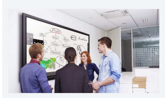
Figure 1. Increase productivity with interactive meetings