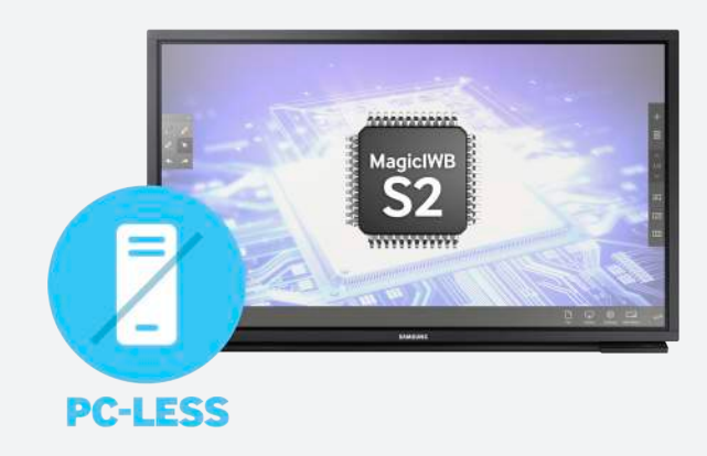
Figure 3. Embedded e-Board Solution that doesn't require a dedicated PC

No Dedicated PC required for Samsung IWB Solution. Flexible PC-Less solution minimizes set-up time and allows for impromptu meetings without any additional equipment. As the display is shipped with embedded IWB Solution software, there is no need to purchase additional licenses to operate the IWB Solution.