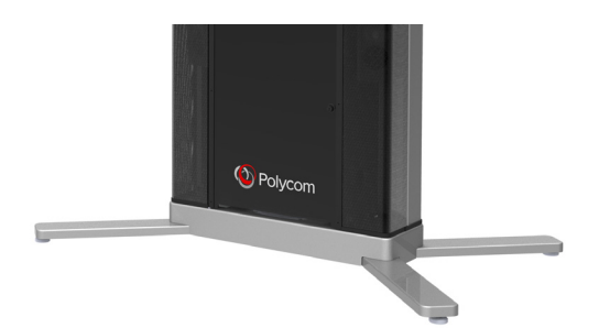
Standard base on RealPresence Group Series Media Center