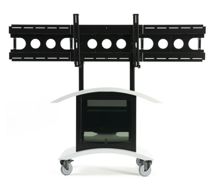
Polycom Media Cart (shown with optional dual display kit)