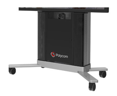
Front panel to allow for lower mounting of camera