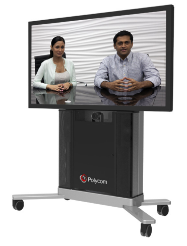
Single 65" shown with optional lower camera mounting panel and casters