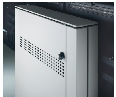
Integrated harness and two 3-way socket modules inside the stand.