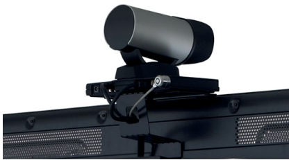
A included free camera mount