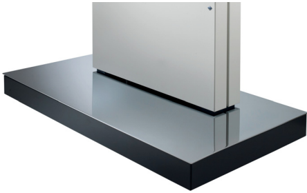
High-quality optic through chrome-plated base