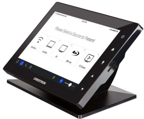
TSW-760-B-S with TSW-760-TTK-B-S Tabletop Kit

High-performance streaming video capability makes it possible to view security cameras and other video sources right on the touch screen. Native support for H.264 and MJPEG formats allows the TSW-760 to display live streaming video from an IP camera, a streaming encoder (Crestron CEN-NVS200 , DM-TXRX-100-STR , or similar [3] ), or a DigitalMedia™ switcher . Video is delivered to the touch screen over Ethernet, eliminating the need for any extra video wiring.