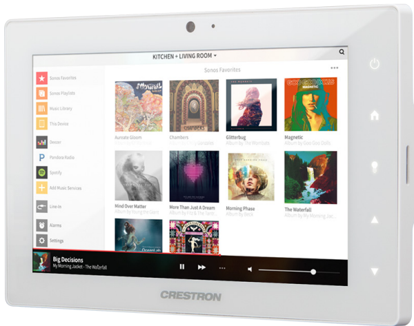
TSW-760-W-S – Shown in White