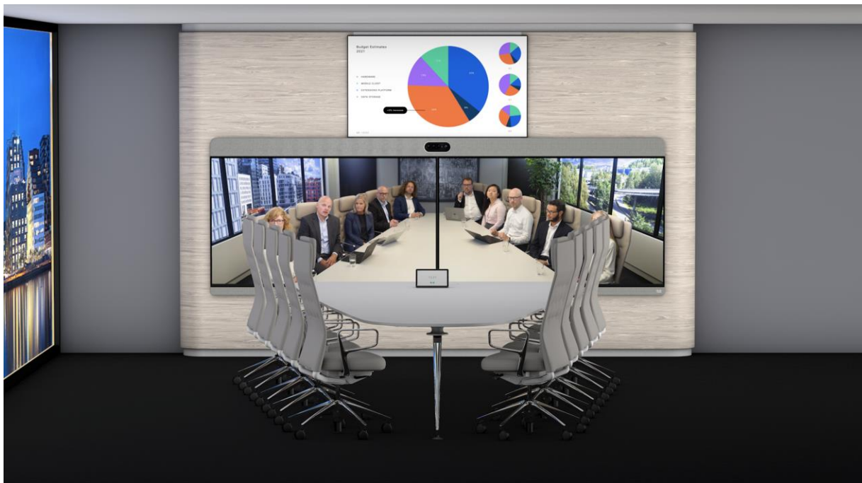
Figure 2. Cisco Webex Room Panorama in a large conference room