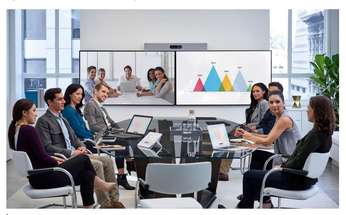
Figure 1. Cisco Spark Room Kit Plus in Large Conference Room

The Room Kit Plus – comprising a powerful codec and a quad-camera bar with integrated speakers and microphones – is ideal for rooms that seat up to 14 people. It offers sophisticated camera technologies that bring speaker-tracking and auto-framing capabilities to medium to large-sized rooms. The product is rich in functionality and experience but is priced and designed to be easily scalable to all of your conference rooms and spaces – whether registered on the premises or to Cisco Spark through the Cisco<sup>®</sup> Collaboration Cloud.