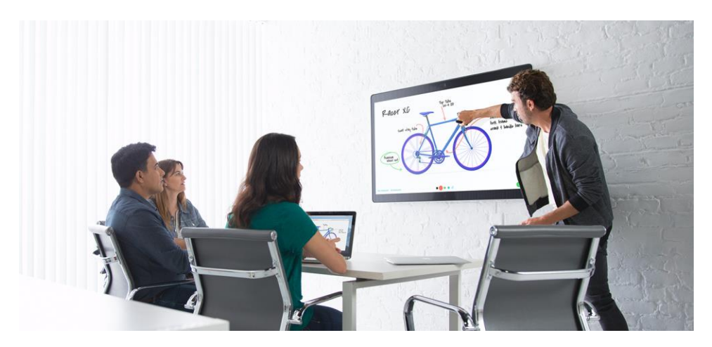
Figure 1. White Boarding Capability on the Cisco Spark Board 55

The Cisco Spark <sup>™</sup> Board is an all-in-one device that provides everything you need to collaborate with your teams in physical meeting rooms. You can wirelessly present, white board, and have video and audio calls. And it securely connects to your virtual teams through the Cisco Spark service, via your Cisco Spark app-enabled devices, so you can take your meetings and content on the road.