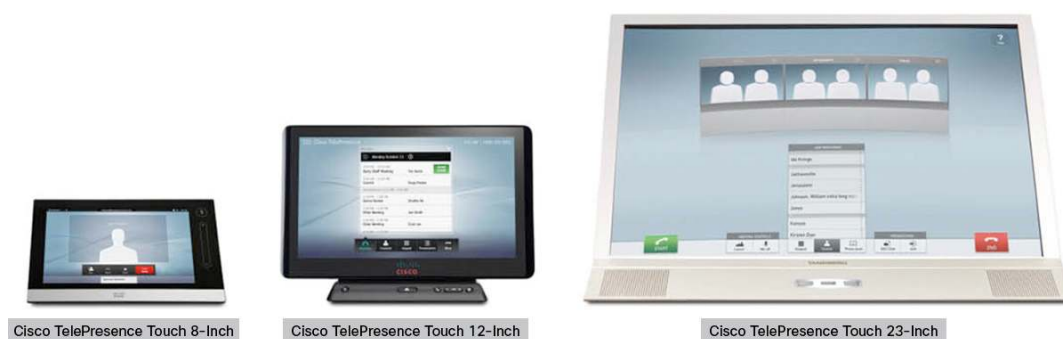
Figure 1. Cisco TelePresence Touch

Cisco TelePresence Touch devices feature a revolutionary user interface focused on people and how they communicate in one-on-one and group settings. Work environments today demand interactions that are distributed across communication mediums and vary with the changing context, contacts, and content. With Cisco TelePresence Touch devices, you can quickly and easily access the most common tasks in the context of your interaction. The innovative design allows effortless integration with the various forms of synchronous and asynchronous communication that are already part of the workflow.