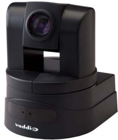
Figure 1: Front of ClearVIEW HD-18

The ClearVIEW HD-18 is an exceptional camera for a wide range of high definition shooting applications, such as houses of worship, corporate boardrooms, live event production and distance-learning.