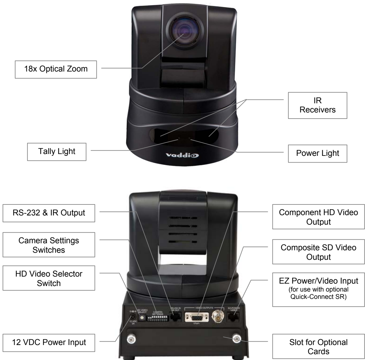
Figure 2: ClearVIEW HD-18 front and rear diagrams with functional callouts.