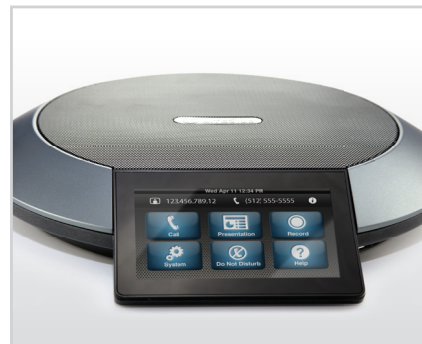
Includes LifeSize® Phone™