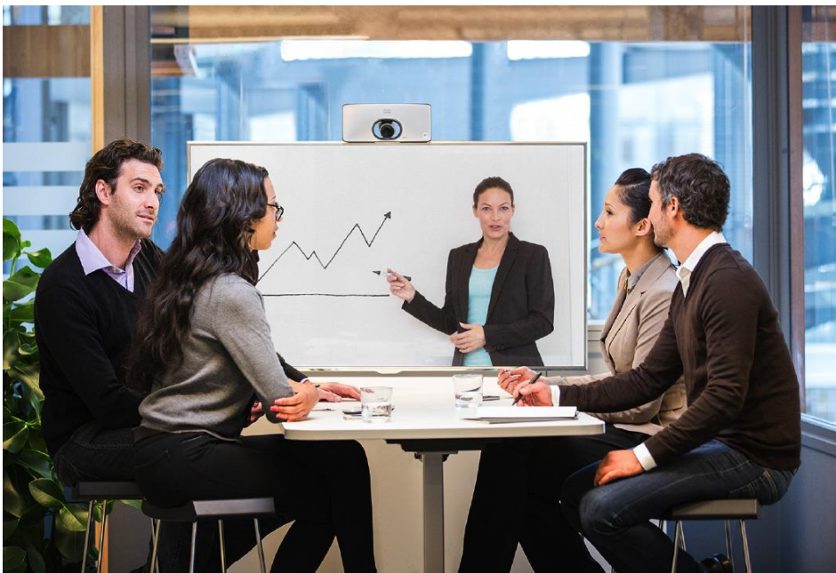
Figure 1. Cisco TelePresence SX10 in a Project Room Environment

High quality, simplicity, and affordability come together in the SX10 Quick Set to create a logical solution for video ubiquity (Figures 1 through 3).