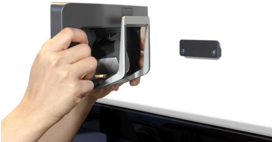
Figure 3. Cisco TelePresence SX10 Wall-Mount Solution