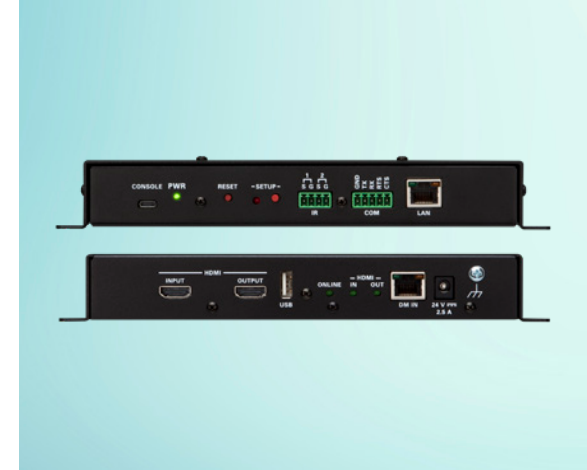
AirMedia Presentation System with AirMedia 2.0, {\rm DM^\circ} in, and HDMI in and out