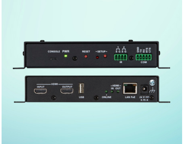
AirMedia Presentation System with AirMedia 2.0 and HDMI° in and out