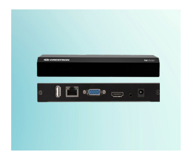
AM-101 Wireless Presentation Gateway